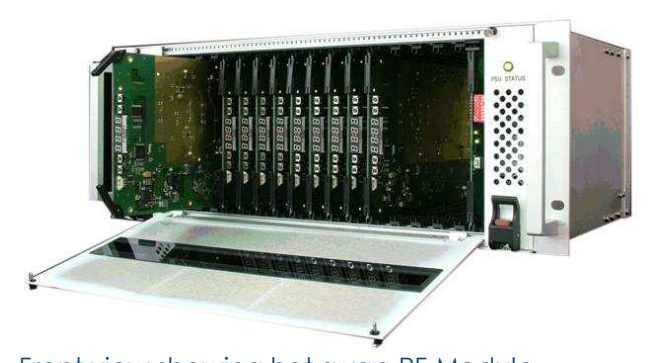
Front view showing hot-swap RF Module