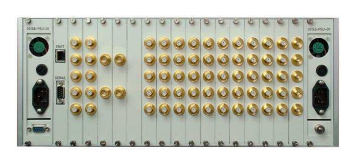
Rear view of chassis

Overview: ETL's model 26128 Modular System offers total flexibility in managing L-band signals. The modular design comprises a chassis with 16 RF slots, two hot swap dual redundant PSUs, and one CPU. Each chassis can hold up to 16 RF modules, which can be hot swapped or hot expanded. This provides excellent resilience and scale ability.